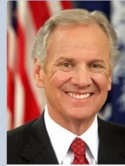
Gov. Henry McMaster Governor of South Carolina