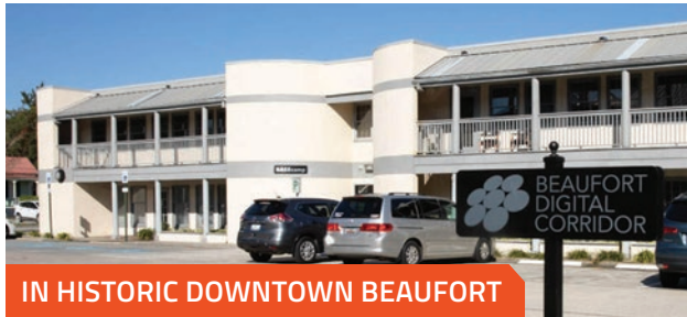
IN HISTORIC DOWNTOWN BEAUFORT

Beaufort’s premier business incubator and co-working office is located downtown and was designed to meet the needs of technology entrepreneurs seeking adaptable, affordable office space and conference facilities with the benefit of access to the Beaufort Digital Corridor’s network of tech and business professionals.