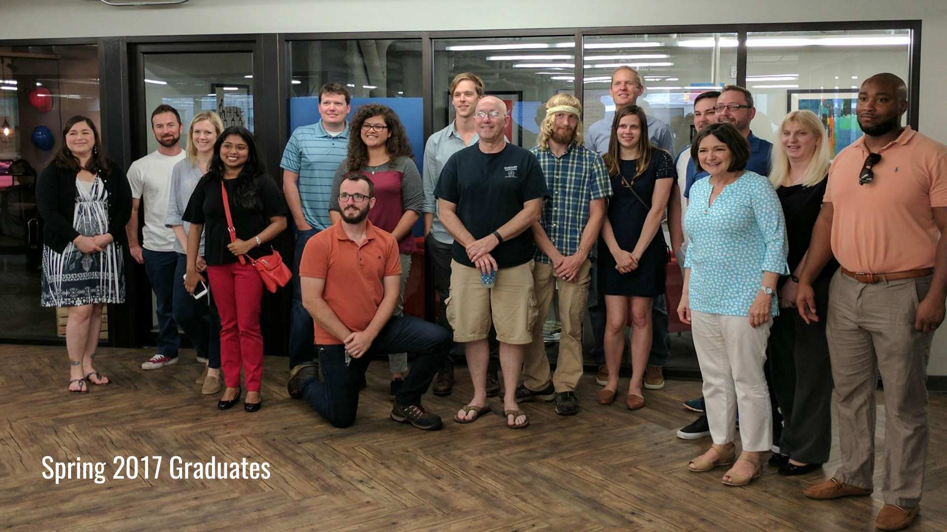
Spring 2017 Graduates